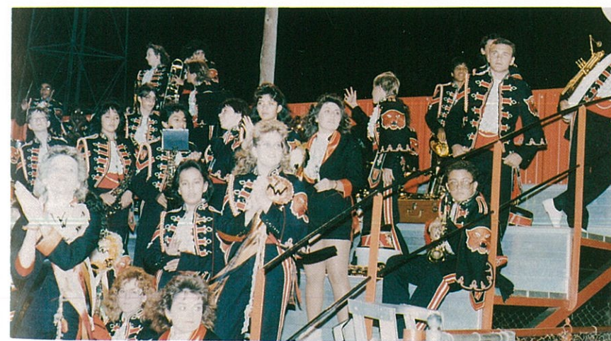
The band shows its spirit as it watches for an oncoming touchdown. Without a doubt the team scored and raised the score even higher.